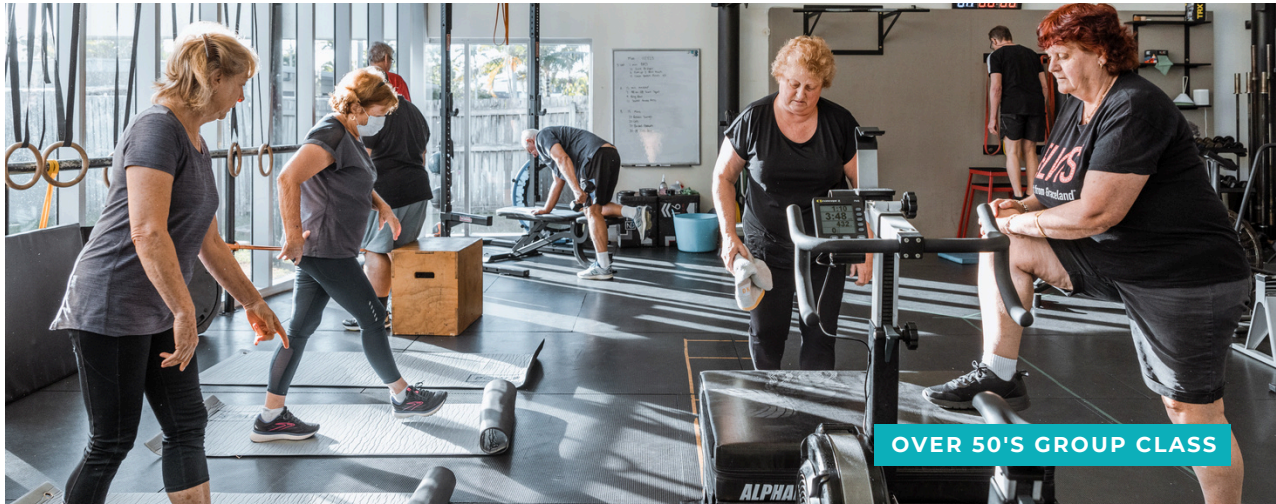
OVER 50'S GROUP CLASS